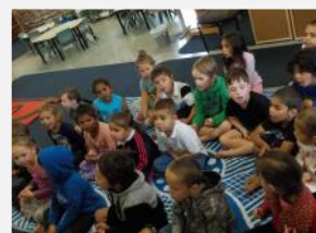
22 Children at Kindy