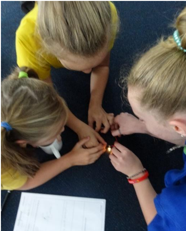
3 heads and 6 hands equals a glowing light bulb!

Students at SPPS have hit the ground running in science! All classes spent the first week settling back into lab routines, preparing their science journals and practising working in teams. This year 90 minutes has been dedicated to the teaching of this important subject area. Students from Pre-primary to Year 6 will cover all four aspects of the National Curriculum throughout 2019. These aspects are: Physical Sciences , Biological Sciences , Earth & Space Sciences and Chemical Sciences . At SPPS we use the Primary Connections program to deliver primary science education across the school. Learning programs are fun, hands on and provide an inquiry-based learning approach that helps students develop deep learning.