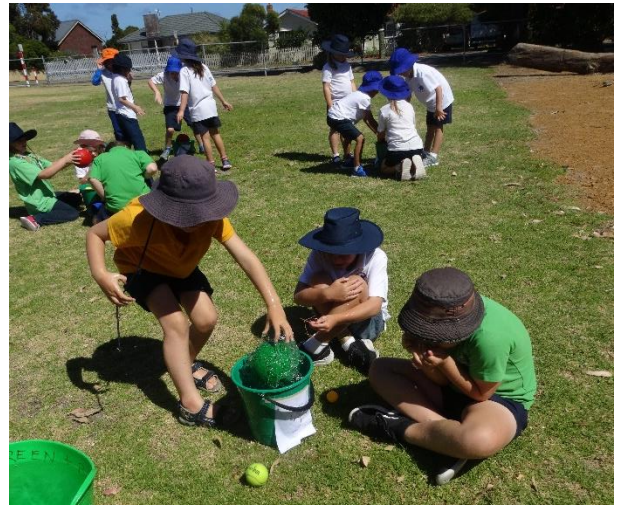
Rm 19 students proved that water pushes back.