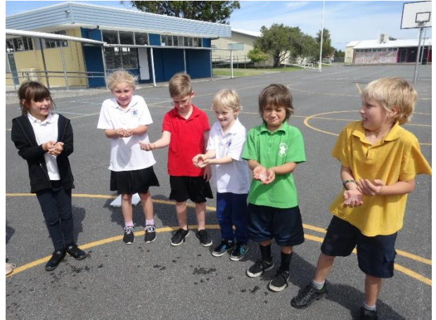
Melting ice-cubes & freezing hands in Rm 1.