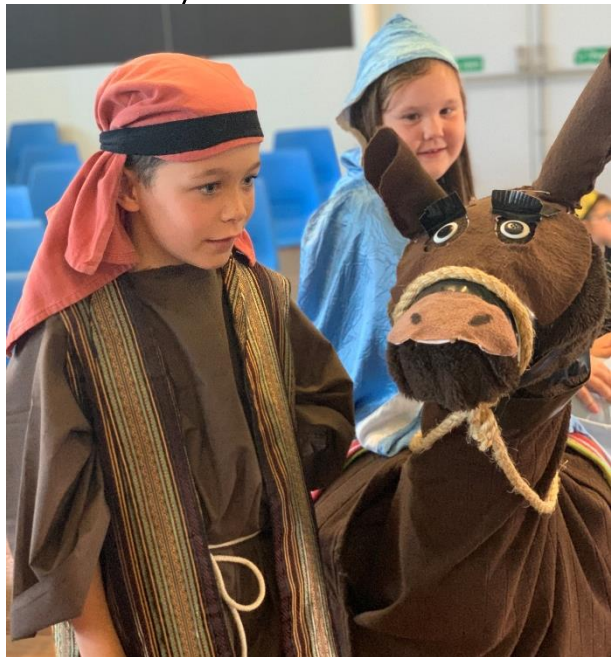
Mary and Joseph

Please enjoy a few images from our Christmas service held on Tuesday 3 December.