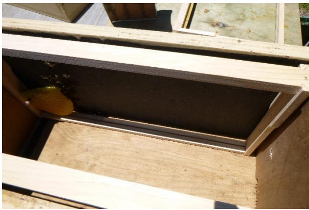
Moving the comb and the Queen bee to the hive box so they can continue building it up. Once the Queen bee is in the new box, the other bees will follow.