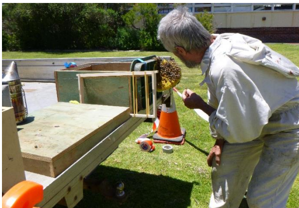
Using elastic bands to hold the comb in place in the frame while the bees get back to work re-building.