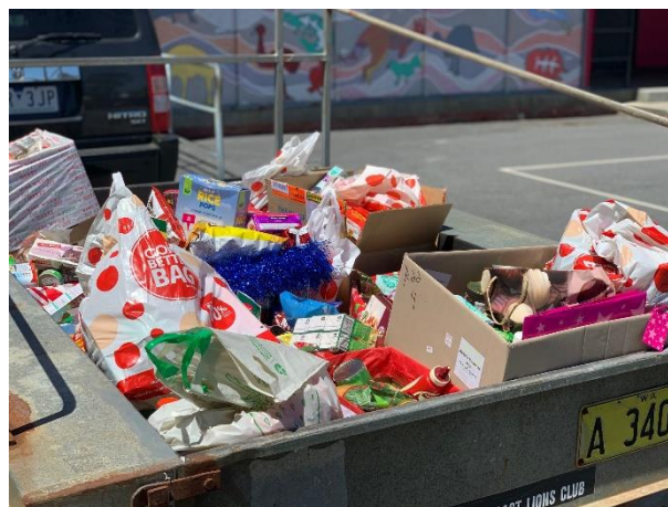
Trailer loaded up for the Salvation Army

Thank you to the Spencer Park Primary School community for your generosity. You are amazing!