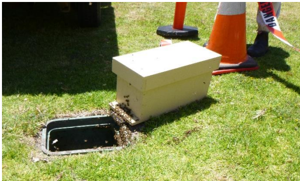
Just waiting for the forager bees to come back to the hive after dark so that they can all go home together.