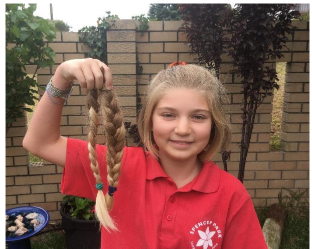
... and after!